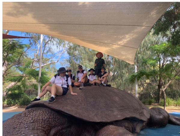
8 - Bibra Lake Group