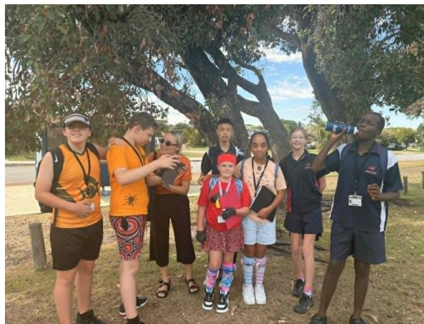
1 - ESC 6 Class Photo