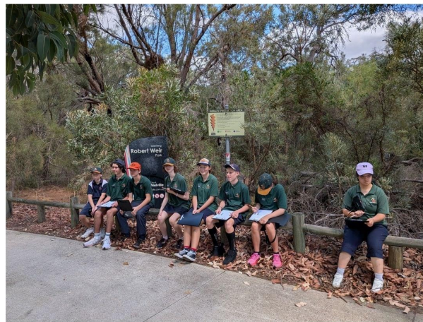
2 - BR Visit

We're so proud of how the students have started the year and are looking forward to all that's still to come!