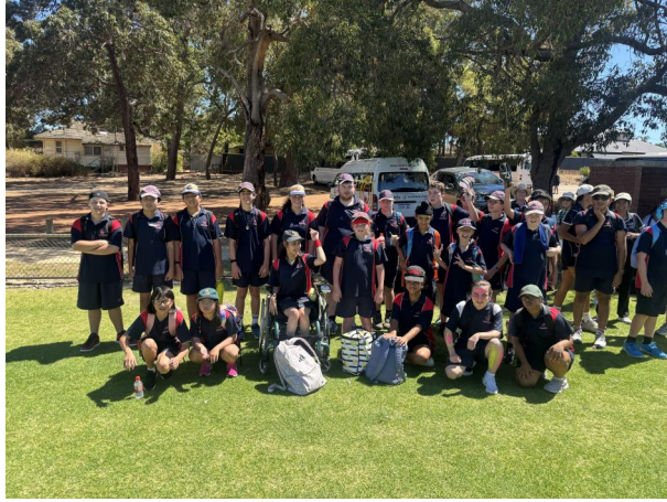
25 - Kalability Cricket Carnival