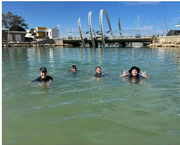
13 - Beach Day

It has been a strong and positive start to the term, and we are looking forward to continuing to build on these experiences in Term 2.