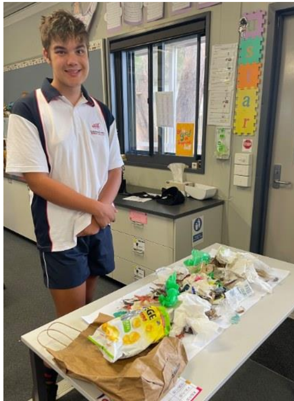
11 - Hunter's Rubbish Collection