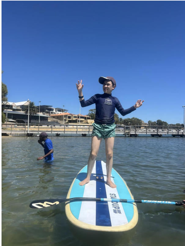
29 - River SUP Boarding