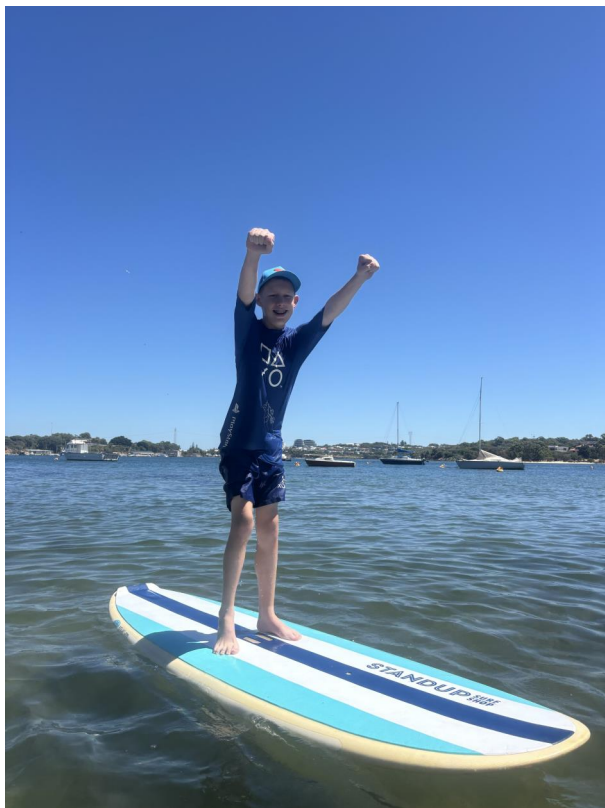
28 - Austin SUP Boarding