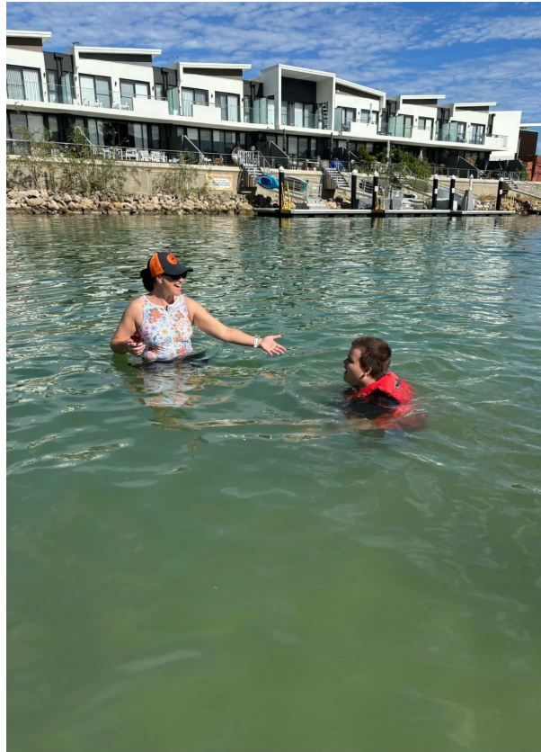
12 - Conna at the Beach