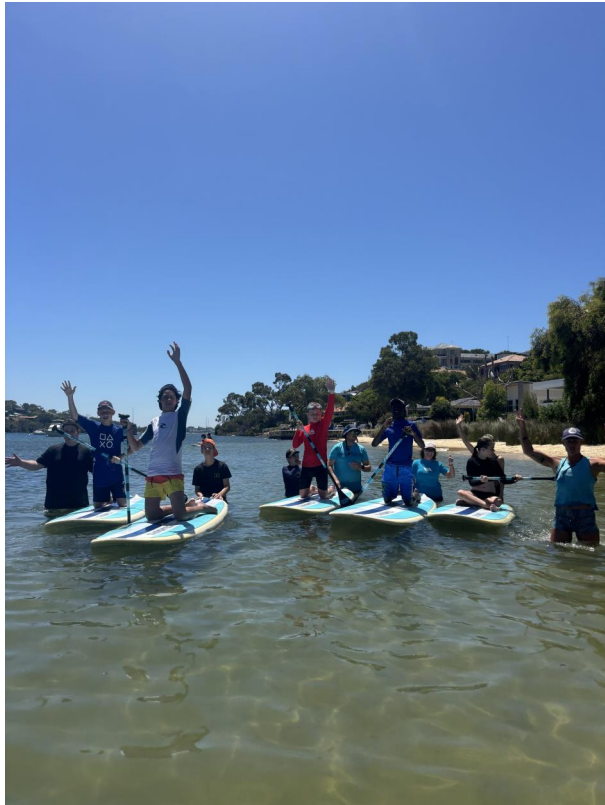
27 - Year 9 SUP Boarding