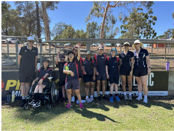
26 - Kalability Cricket Carnival