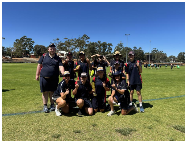
24 - Kalability Cricket Carnival Division 1 Team

We look forward to Term 2, with many exciting events happening, including the Kalability AFL carnival, the Push Up Challenge, Rugby WA clinics, and much more.